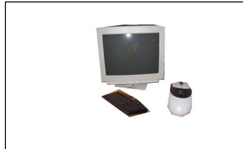
Figure 1: SOILIE’s imagined output given the query ‘mouse’ and the returned labels: ‘computer’, ‘keyboard,’ ‘monitor,’ and ‘screen.’

things should be located, the mental scene is passed on for further processing—perhaps mental imagery.